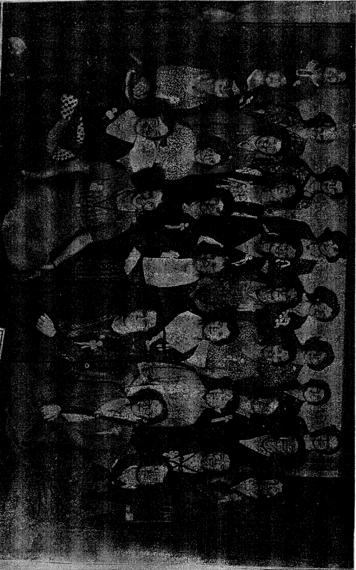
Some of the Long Island women who attended the Parent-Teachers Association convention held at Albany, where noted educators discussed matters of interest to instructors and parents.