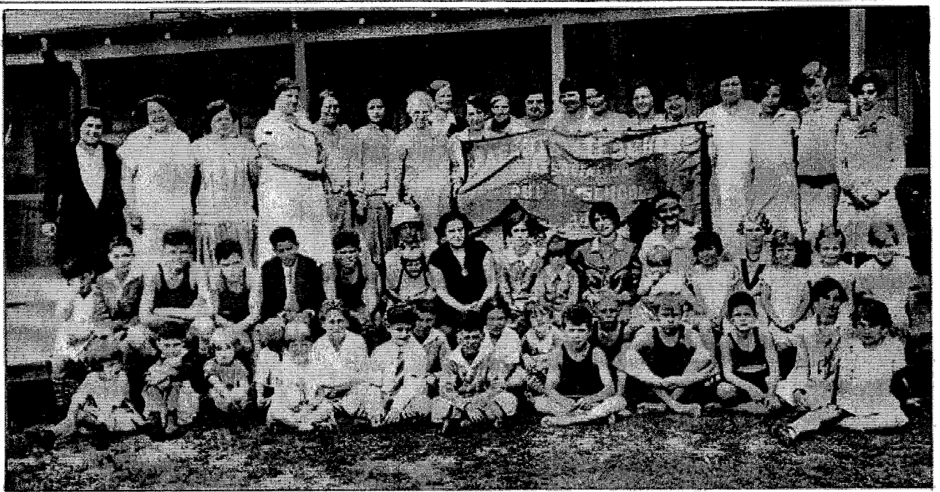
MAINTAINING A SUMMER'S INTEREST IN SCHOOL AFFAIRS: LADIES of the Parent Teachers' Asso- ciation of Public School 30 in Valley Stream, With Some of the Children Who Were Their Guests on the Annual Outing to Sayville.